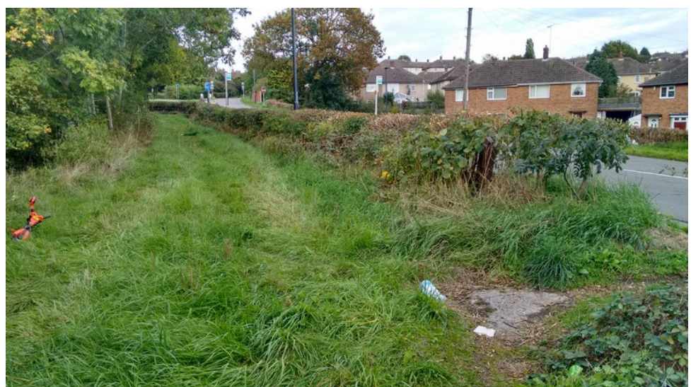
Suggested route looking north from half way along

The existing path appears to be part of an old road as there is some tarmac in place although heavily overgrown with grass.