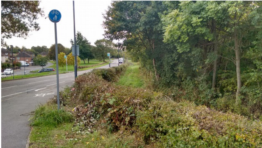
Suggested route from northern end (behind hedge)