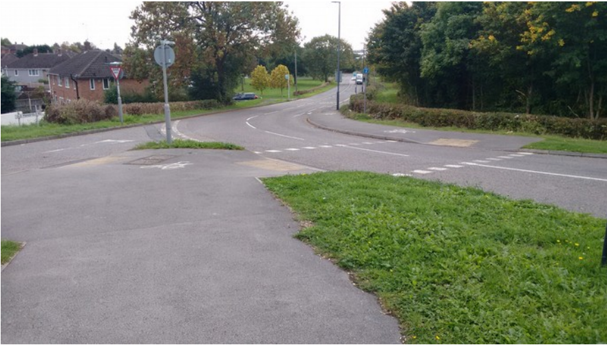
North end of route showing "island" and uncontrolled road crossing and a sliproad from Mansfield Road.