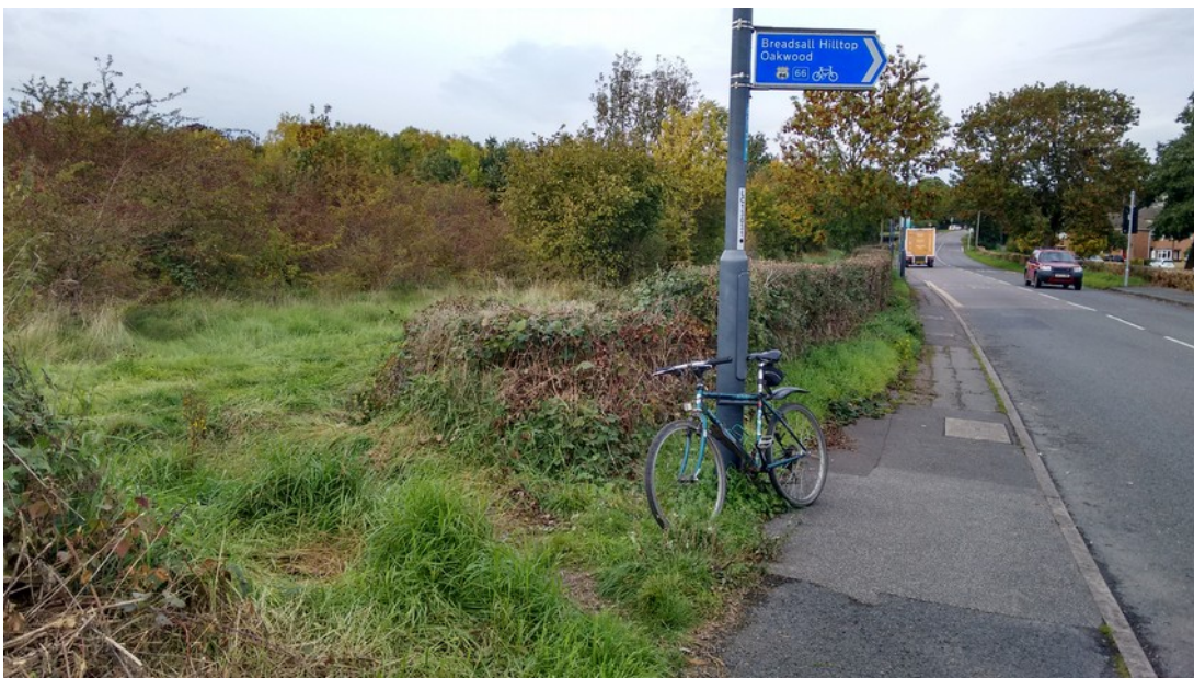
Suggested route from turn off for Route 66