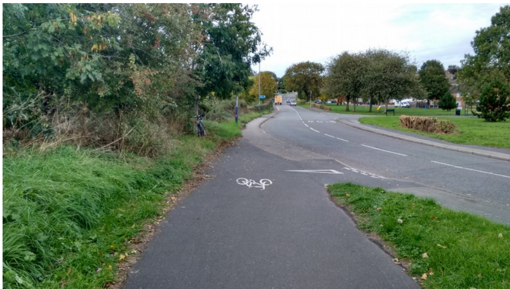
End of route 66 from Derby travelling north